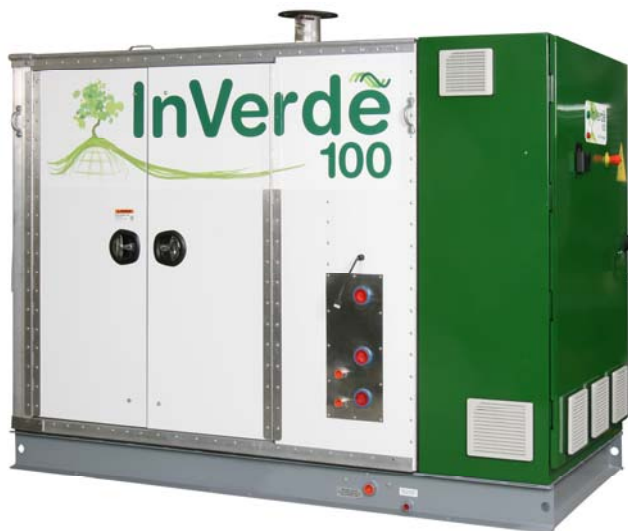
Figure 1. Tecogen InVerde Module Model INV-100

The InVerde Module, conceptually depicted in Figure 2, features a low-emissions natural gas engine, which drives a water-cooled permanent magnetic generator (PMG). The engine is operated over a wide speed range, depending on the load requirement, while the power electronics convert the variable frequency output from the PMG to high quality 60-Hertz power. Variable speed operation in grid-tie mode maximizes fuel